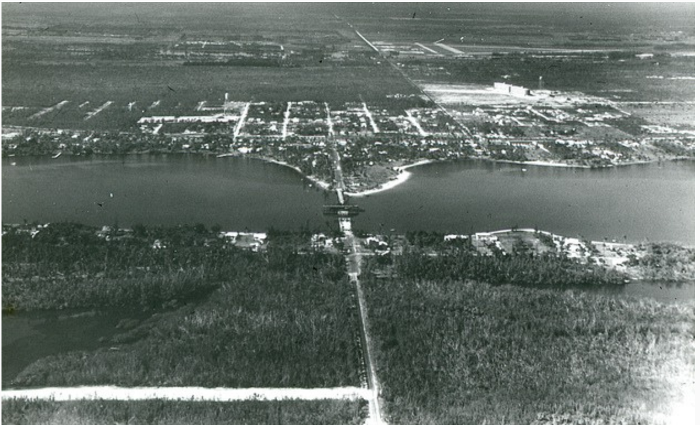
LANTANA AERIAL VIEW, CIRCA 1946.

Town of Lantana 500 Greynolds Circle Lantana, FL 33462