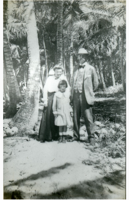
LANTANA FAMILY UNDER THE PALMS, C. 1905